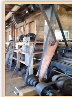
1920's Line Shafting and Motors